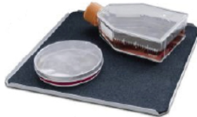
Flat Platform With non-Slip Rubber Mat SPP-4