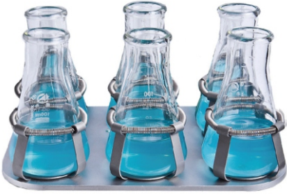
Platform With Clamps SP6-250