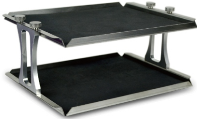
Double Deck Flat Platform With non-Slip Rubber Mat SPP-4D