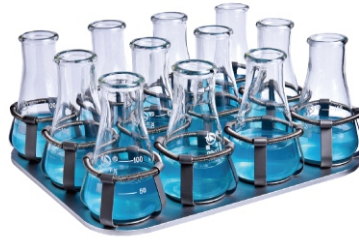
Platform With Clamps SP12-100