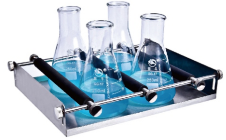
Universal Platform with Adjustable Bars SUP-12