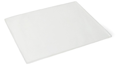
Sticky Pad SPD-GS used in the platform PP-4 or SPP-4A